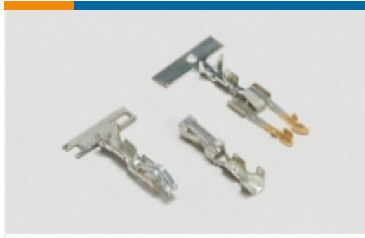
Board-to-Board Connector Contacts(1)