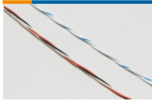
Twisted Pair Cable(6)